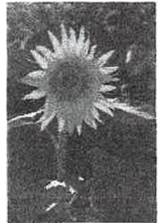
Biodiesel can be made from sunflower oil